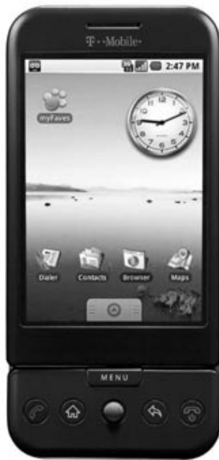
The G1 "Google" phone next to the Apple iPhone

However, the most interesting feature of the smartphone lies in Android's open source nature. Software development for the G1 does not require